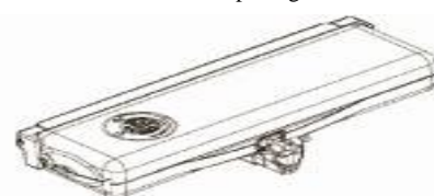
Standard brackets for top and bottom hung windows