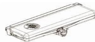
Standard brackets for top and bottom hung windows