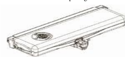
Standard brackets for top and bottom hung windows